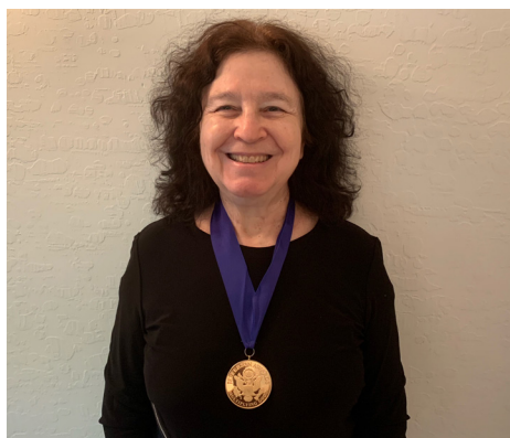
2020 Jefferson Award Winner